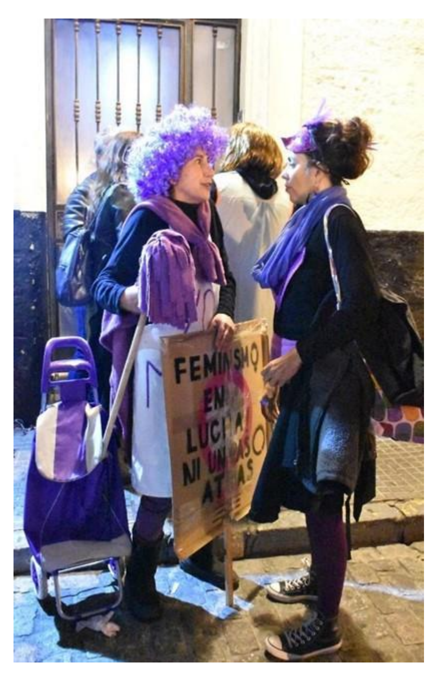
Figure 4: It smells like purple. A feminist activist in conversation during a performance at the Falla Theatre, Spring 2019.