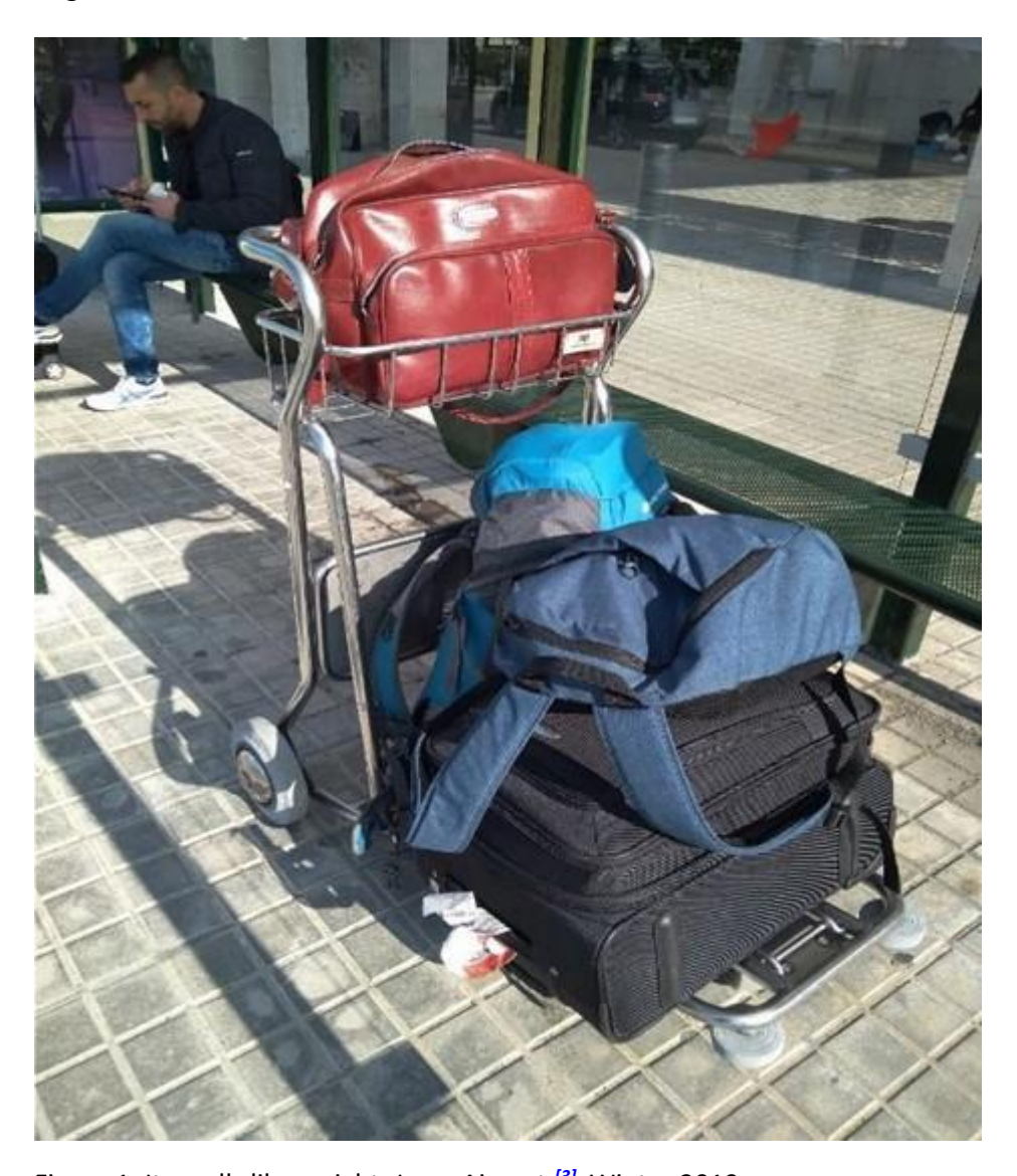
Figure 1: It smells like weight. Jerez Airport, Winter 2019.

My dear, the instant I emerge from the aeroplane it smells like burnt cement, it smells like sunburnt skin, it smells like the air from a hair dryer and it smells like southern voices that drop their s's, it smells like salt in the background and like black hair. It smells like a bottle of olive oil forgotten in the backyard. It smells like the road and like home. It smells like the bags I can't lift.