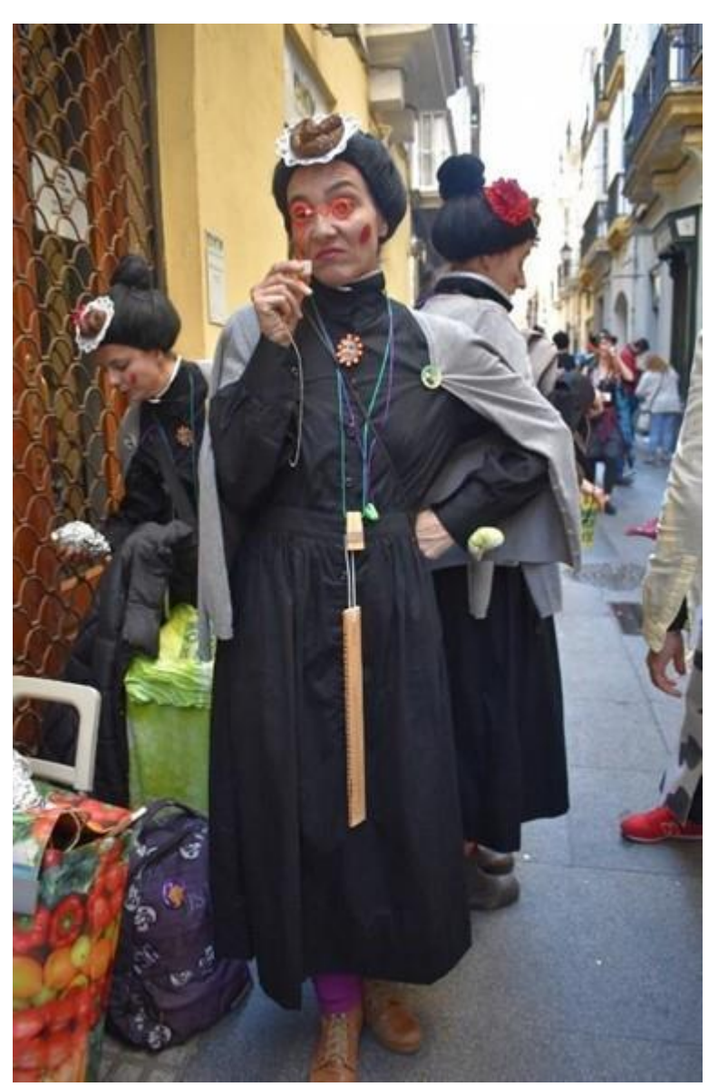
Figure 3: It smells like nuns wearing shit cupcakes. Cadiz, Spring, 2020.